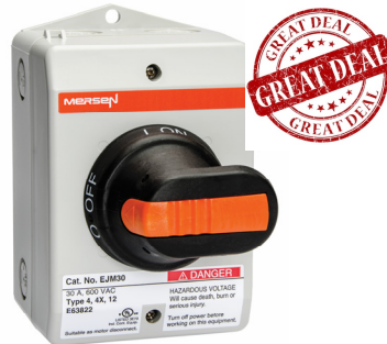
Mersen EJM30BS0 Line of sight enclosed disconnect switch